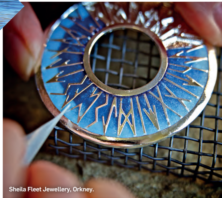
Sheila Fleet Jewellery, Orkney.

No doubt inspired by the incredible landscapes, these islands are a vibrant hub for arts and crafts which you can experience along the Shetland Craft Trail . You can even take part in craft workshops such as knitting, weaving, painting, sculpture, printmaking, woodwork and more.