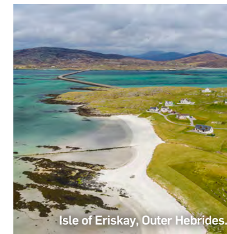
Isle of Eriskay, Outer Hebrides.

While on the islands, be sure to make time for a Saltbox Sauna wild coastal experience. The company operates three mobile saunas