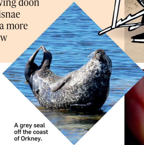
A grey seal off the coast of Orkney.

That's why he's heading to explore Scotland's stunning islands. An' even better, Wullie has discovered that wi' a wee bit planning, it's much easier to reach Orkney, Shetland and the Outer Hebrides than he thocht! So, let's find out what highlights Wullie has planned for braw island escapes wi' The Broons.